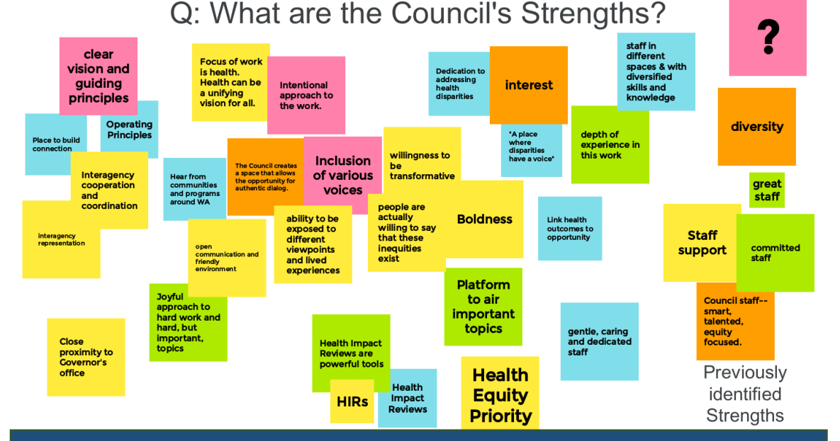
Question: What are the Council's strengths?

We need to be intentional in using an anti-racist lens and inclusive language in the statute.