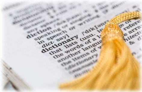
Definition of 'Equity'